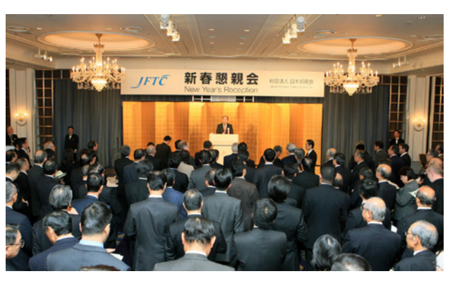
Scene of the Reception