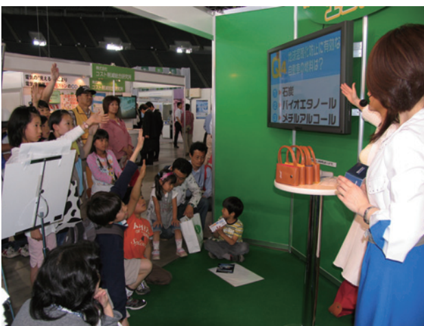
Children participating in a quiz competition

The JFTC's booth activities included a quiz competition entitled "Have Fun Learning to be an Eco-PhD" with questions and answers on such topics as new energy sources, recycling, and environmental protection. A large number of children participated on Saturday, the last day of the exhibition, deepening their interest in environmental problems.