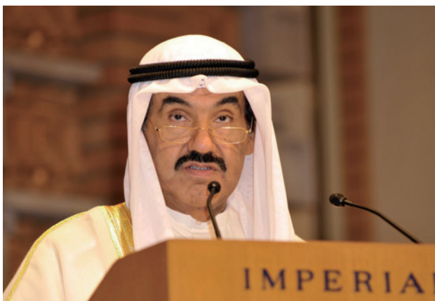
His Highness Sheikh Nasser Al Mohammed Al Ahmed Al Sabah, the Prime Minister of the State of Kuwait

On the occasion of the visit to Japan of His Highness Sheikh Nasser Al-Mohammed Al-Ahmed