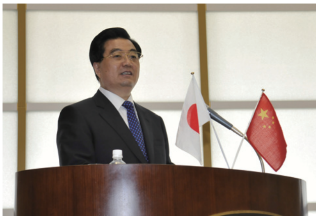
His Excellency Mr. Hu Jintao, President of the People's Republic of China

After opening remarks by Nippon Keidanren Chairman Fujio Mitarai, President Hu took the podium and discussed his desire to further develop a mutually beneficial relationship based on common strategic interests between China and Japan.