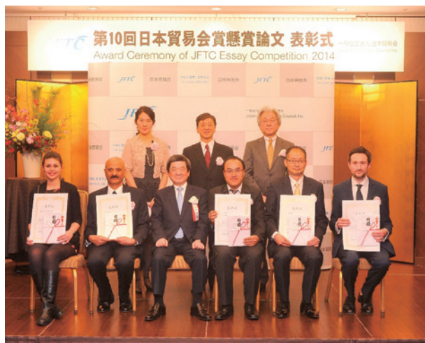
Award Ceremony of JFTC Essay Competition 2014