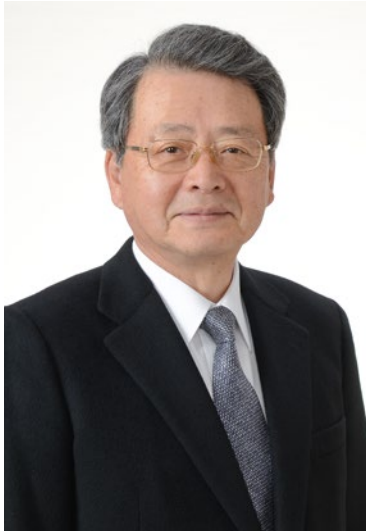
Chairman KOBAYASHI Ken (Chairman, Mitsubishi Corporation)

Amid this growing momentum of international cooperation, the Shosha sector is now required not only to continue its efforts to promote and expand trade and investment, but also to contribute to the building of a sustainable economy and society through a review of supply chains broken by the COVID-19 crisis, initiatives to resolve social issues such as climate change, and the creation of new businesses that make full use of digital transformation.